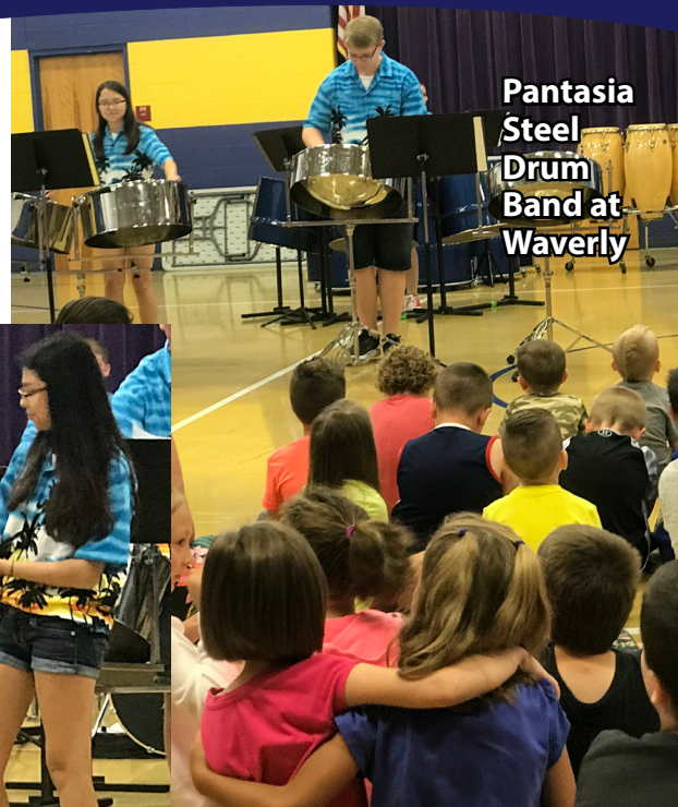
Pantasia Steel Drum Band at Waverly