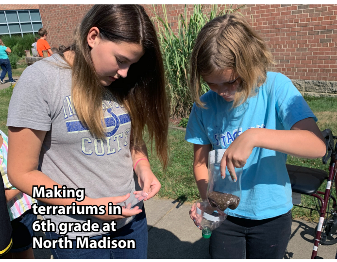
Making terrariums in 6th grade at North Madison