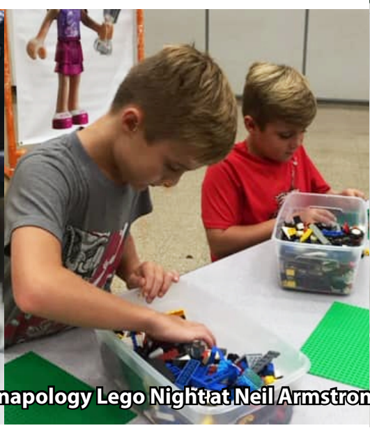
Snapology Lego Night at Neil Armstrong